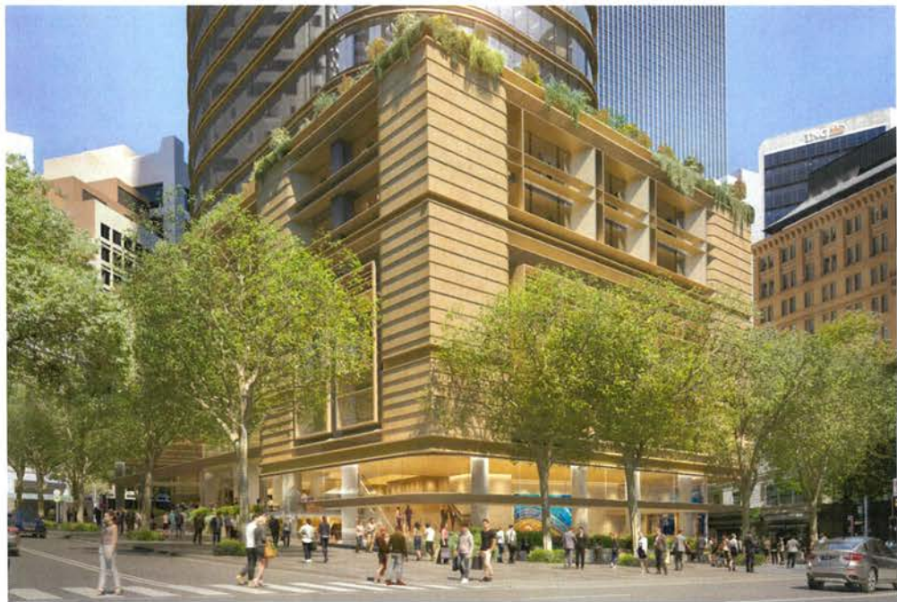
Figure 1 - Artists impression of future Bridge Street Plaza

It is noted that contributions and levies will apply in respect of the above legislation and guidelines and will be considered in subsequent project stages.